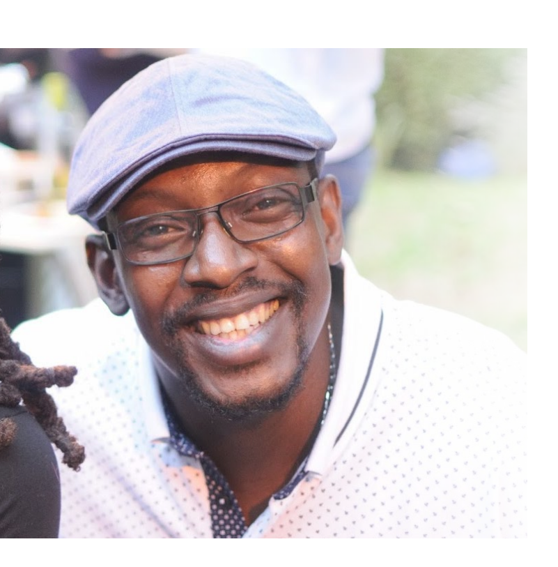
Photos taken at Depford Housing Co-op residents' summer BBQ.